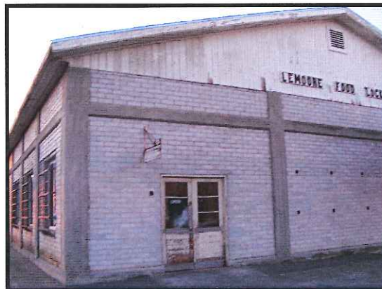
Lemoore Food Locker