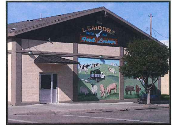
Lemoore Food Locker